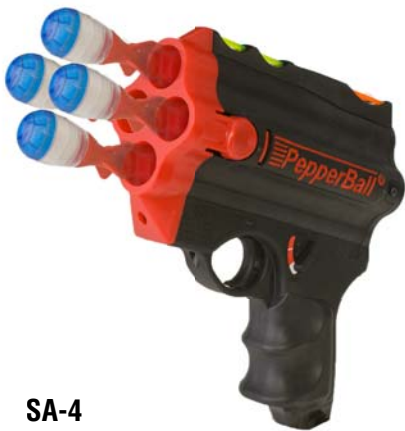
SA-4 Quick Reload Magazine Available