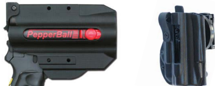
SA-4 System Available with Custom Blade-Tech Holster in the Left/Right Standard or Cross-Draw